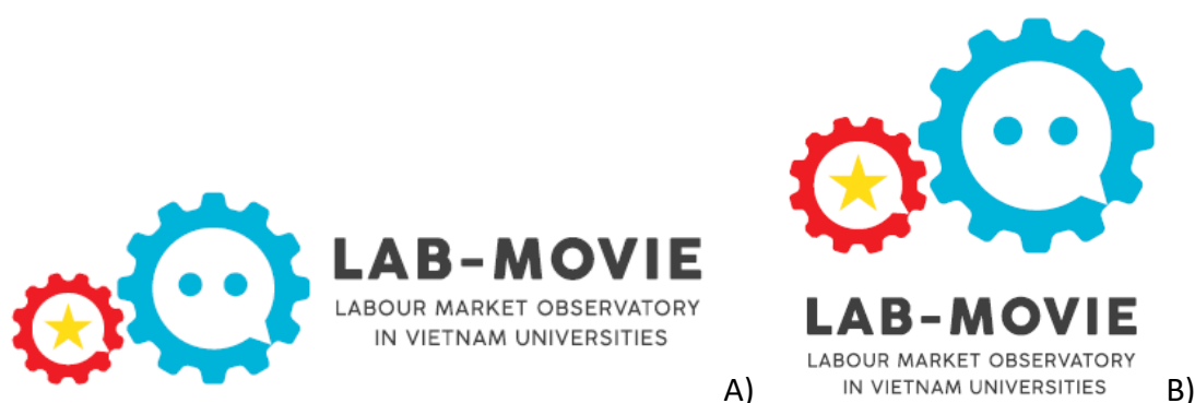
Fig. 1: Selected logo for the Lab-Movie Project. A) Horizontal logo, B) Vertical logo

The selected logo is shown in Fig.1. It includes two sprockets, one representing Vietnam and another the labour market observatory.